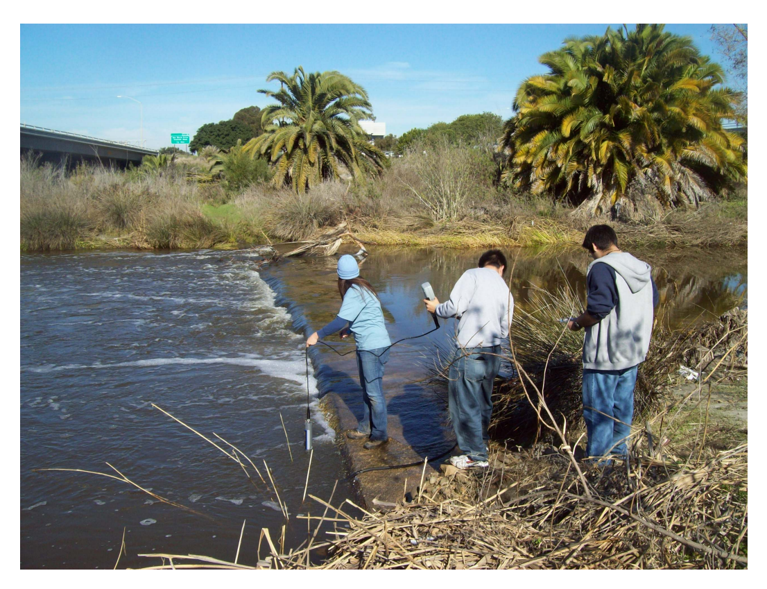
Site 1 - Lower Mission Valley (between Pacific Hwy/I-5) Western most reach of LSDR at Estuary