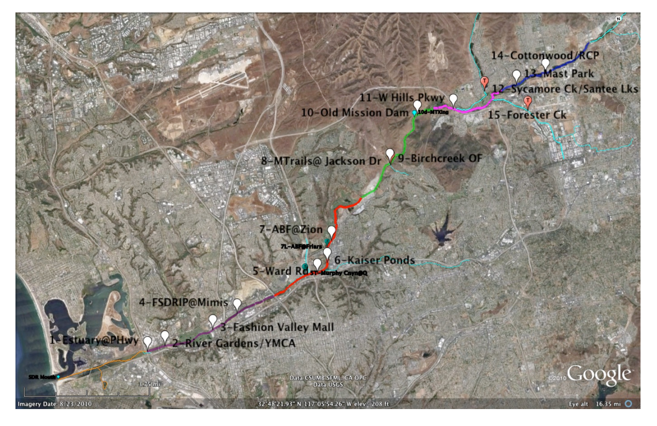
Figure A.1 - Lower San Diego River Catchment and WQM Sites

Color Code for LSDR reaches on figure above: Estuary (orange), LMV (purple), UMV (red), MG (dark green), LSB (violet), USB (dark blue), Lakeside (light green), tributaries (light blue). Figure details can be downloaded through Google Earth from SDRPF website/River Monitoring page: file <Fig1.1WQMR.kmz>