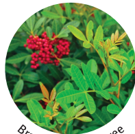
Brazilian pepper tree