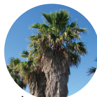
Mexican fan palm