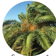
Canary date palm